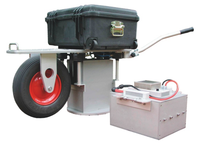
The vibrator source with active vertical vibrator kit (mounted) and additional horizontal vibrator kit (right side).

The Vibrator Source ElViS III is used to generate P- or S-wave sweep signals. The source consists of a moving mass driven by a cascaded linear motor. The source is fully cased. An adjustable pneumatic suspension ensures a maximum release of seismic energy under different surface conditions. The source is most suitable for reflection seismic surveys on paved roads and for urban areas.