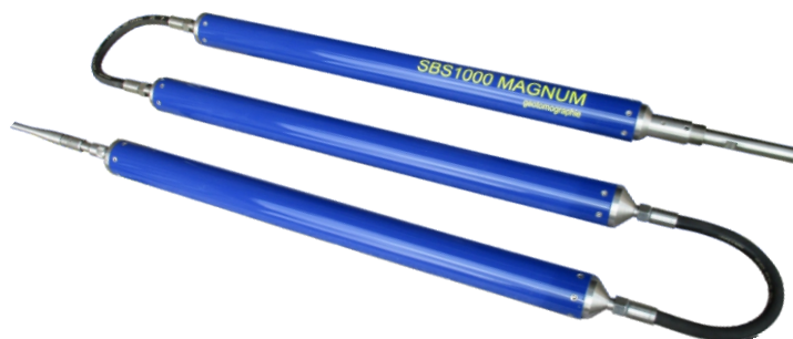
P-wave source SBS1000 Magnum.