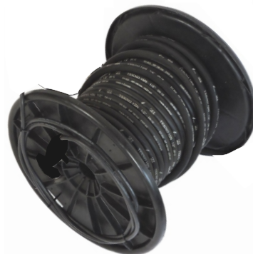
The multistation borehole geophone string is coiled on a drum.